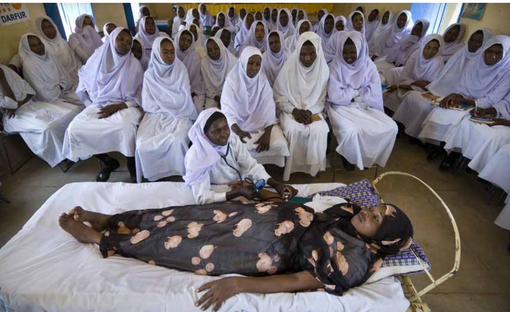
Students at the UNFPA-supported Midwifery School of El Fasher examining a pregnant woman. El Fasher, Darfur, Sudan. June 2007.