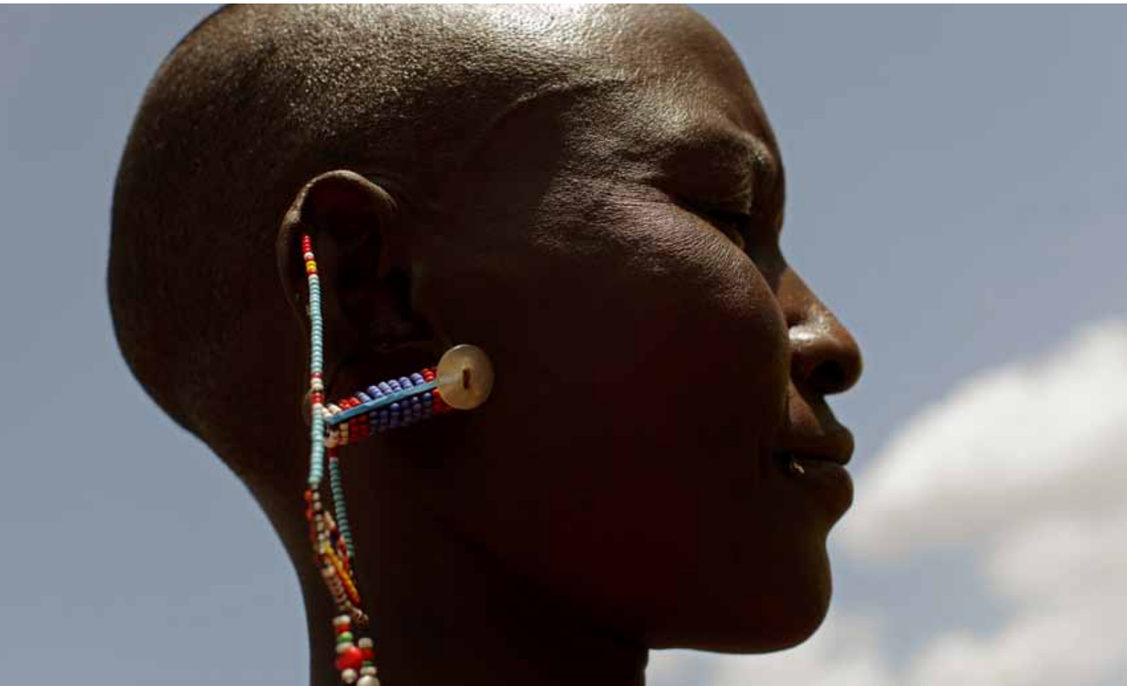
A Masai woman in the Rift Valley province, Kenya.