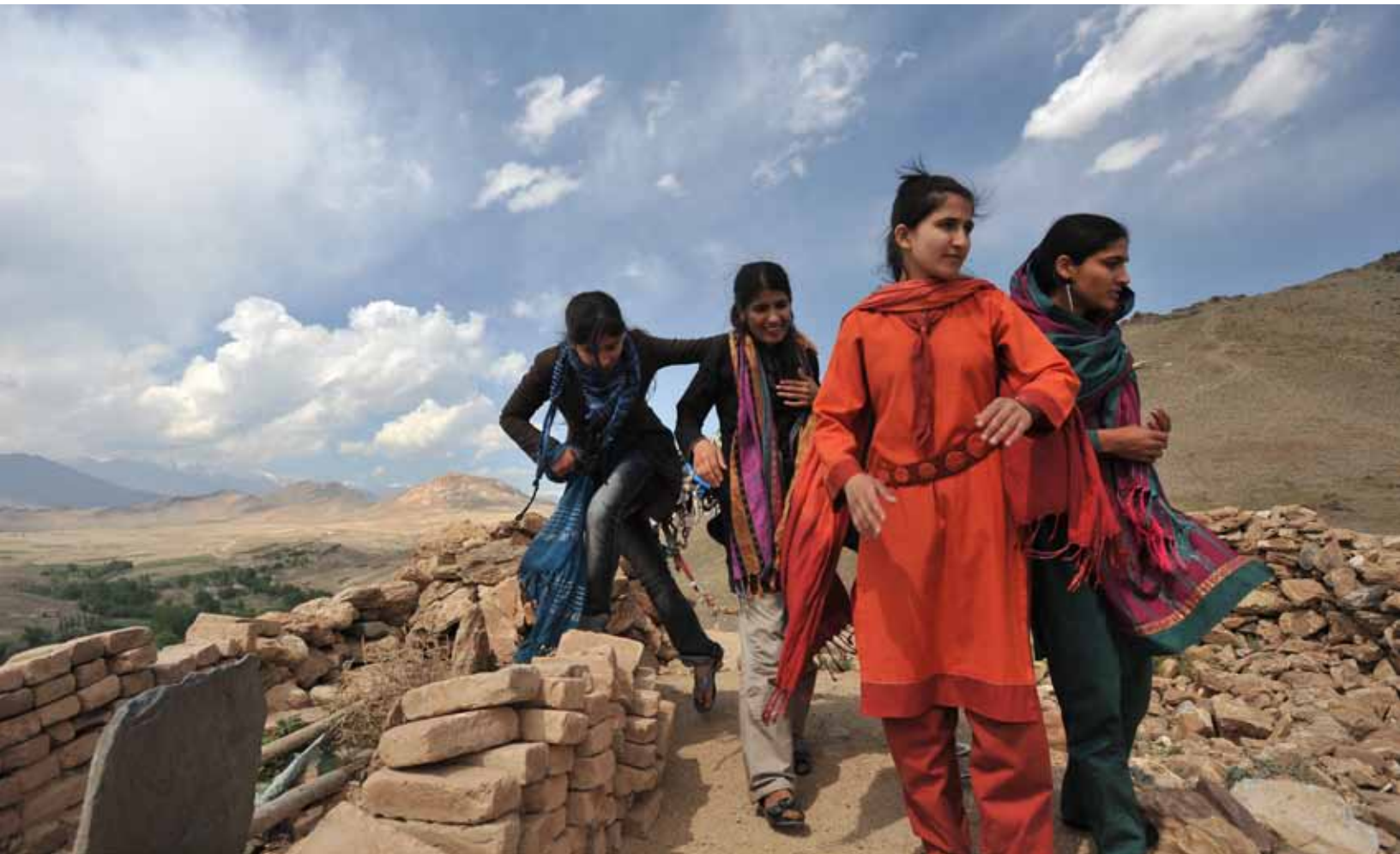
Young girls in Afghanistan.