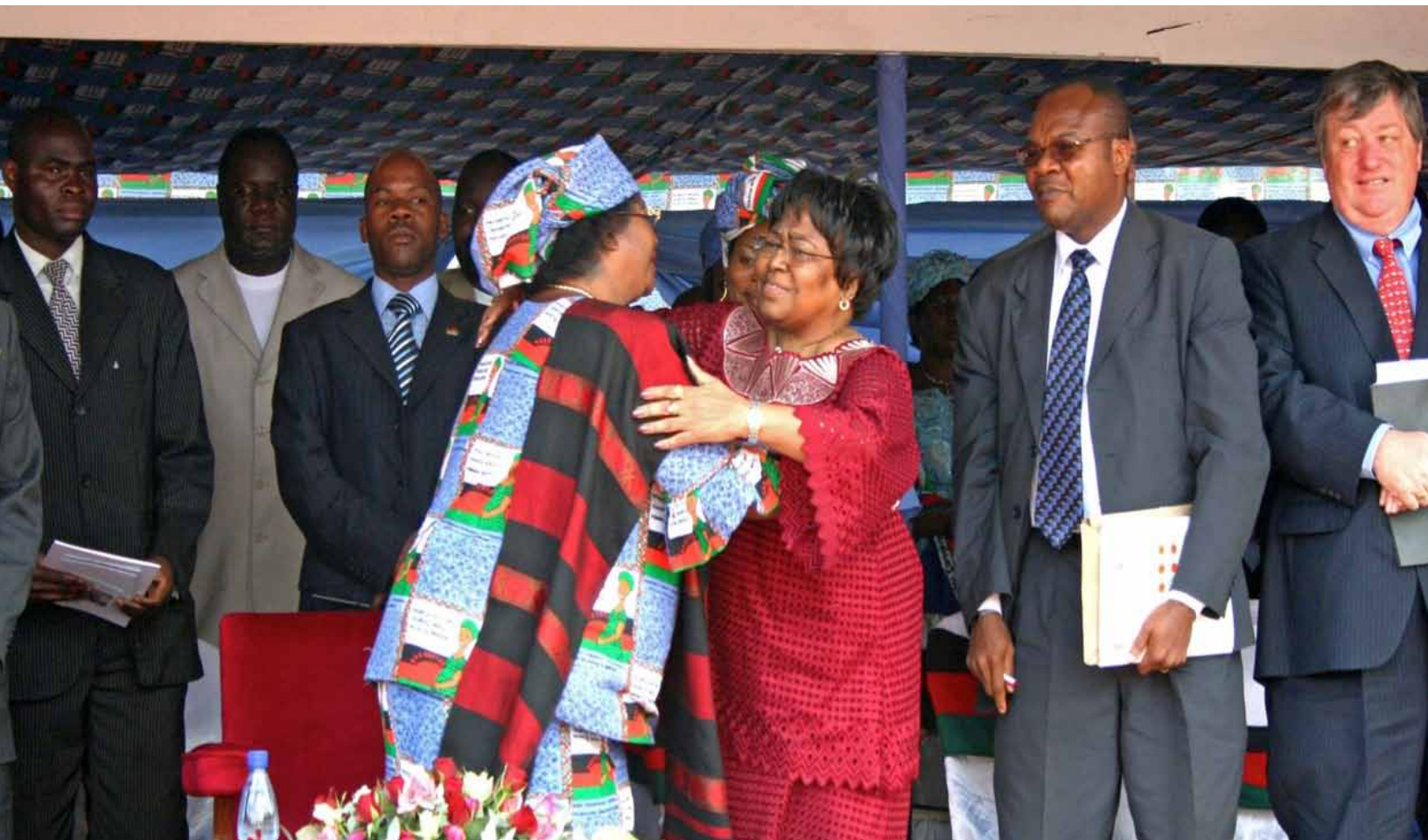
Scene from inauguration of the the Campaign on Accelerated Reduction of Maternal Mortality in Africa (CARMMA) in Malawi.