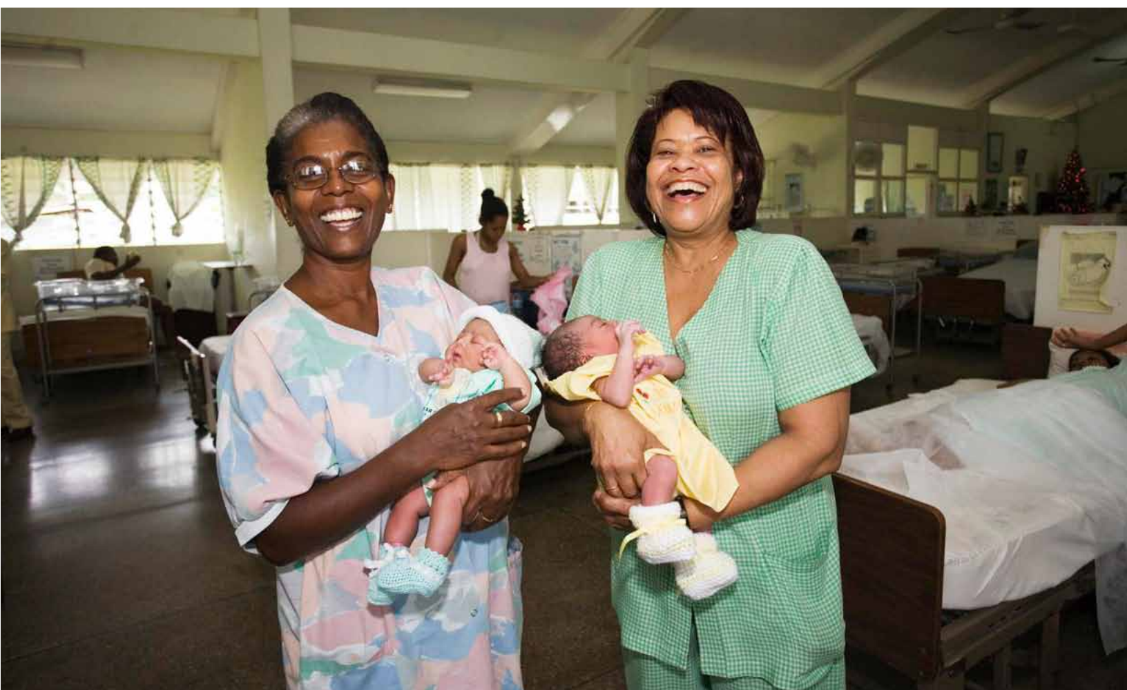
Sangrend maternity hospital, Port of Spain, Trinidad.

During national discussions about maternal health policies and strategies, the programme's Country Midwife Advisors will serve as strong advocates for the midwifery profession and its potential impact on reducing maternal mortality. The year 2010 will be decisive in this respect, with major advocacy events and further expansion of the programme planned in the Africa and Asia regions.